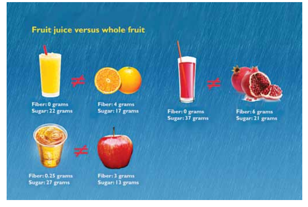
Fig. 2. Comparative differences of sugar and fiber concentration among fruit juice and whole fruit.

Fig. 1. Amounts of added sugar in various popular sugar-sweetened beverages. Note that the Starbucks beverage is a caramel macchiato, the most popular beverage at the Fruitville Pike Starbucks in Lancaster, Pa.