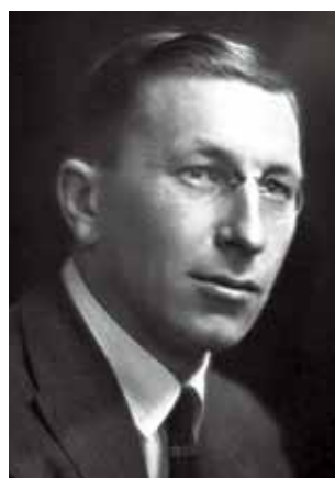
Canadians Frederick Banting and Charles Best discovered insulin in 1921.