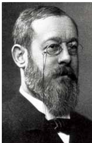
In 1886 German physician Joseph von Mering discovered that phlorizin induced glycosuria.