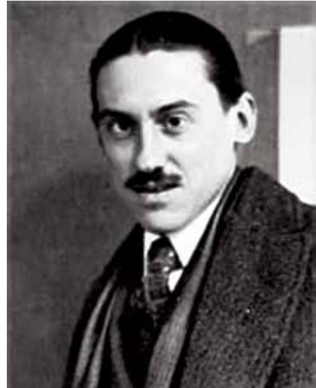
In 1923, Lancaster artist Charles Demuth was one of the first Americans to receive insulin.