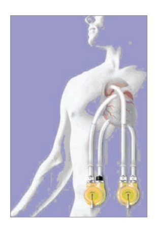
Figure 3: Thoratec<sup>®</sup> VAD Illustration – Thoratec Corporation

He had sustained a massive myocardial infarction less than 6 hours before arriving at the ER and had no chance of survival without immediate surgery. Since both ventricles needed support, both a left and right VAD were implanted. was stabilized, After he he was transferred to the Hospital of the University of Pennsylvania where he received a heart transplant approximately three months later. He is currently at home