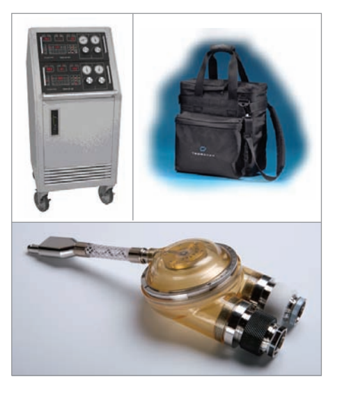
Figure 4: Thoratec<sup>®</sup> Percutaneous VAD System – Thoratec Corporation

The second patient, a 47-year-old man, entered the ER with chest pain and we determined that he had sustained a myocardial infarction more than 21 days previously. We carried out an elective coronary artery bypass graft (CABG) procedure, but on the first postoperative day he decompensated and required treatment for lethal arrhythmias. Left and right VADs were implanted and, once stabilized, he was also transferred to the Hospital of the University of Pennsylvania for heart transplantation, which was performed one month later. He is now doing well.