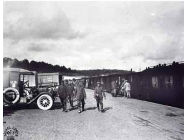
Fig. 3. View of the receiving and dispatching platform in front of Evacuation Hospitals Nos. 6 and 7 at Souilly. The soldiers walking towards the photographer are German prisoners of war.

Evacuation Hospital No. 7 started operating as a hospital again on August 28, but at first the cases were mainly personnel with influenza/Spanish flu (see below). The Battle of St. Mihiel, the only offensive launched solely by the U.S. Army in WWI, 5 commenced on September 12 and ended September 14. 9,10