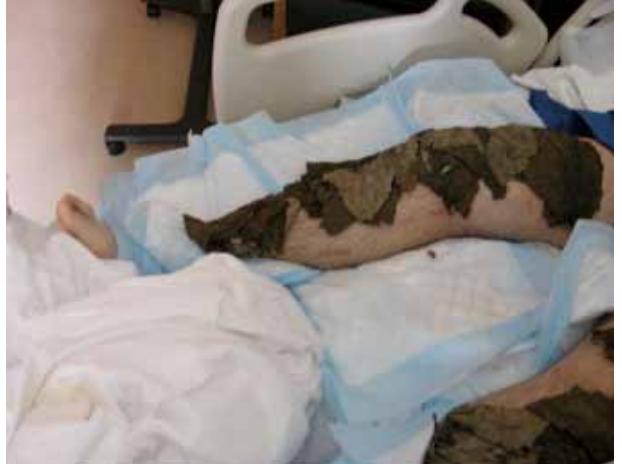
Fig. 2. "Samuel" receiving a Burdock leaf treatment

Burdock is a traditional medicinal herb used for many ailments, and is a common component of traditional Chinese medicines. Folk herbalists consider dried Burdock to be antibacterial, antineoplastic, antioxidant,<sup>5</sup> antiretroviral, and anti-inflammatory, 6,7 and they feel it also has hepatotprotective properties.<sup>8,9</sup> Burdock root oil extract, also called Bur oil, is popular in Europe as a scalp treatment applied to improve hair strength, shine and body, help reverse scalp conditions such as dandruff, and combat hair loss. Burdock root oil extract is reportedly rich in phytosterols and essential fatty acids (including rare long-chain EFAs), 9,10,11 the nutrients required to maintain a healthy scalp and promote natural hair growth. However, minoxidil is the only topical treatment that has been shown to improve hair growth in controlled studies.