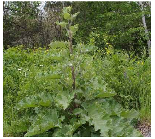
Fig. 1. Burdock Plant Burdock Heart-shaped Leaf Flower of Burdock