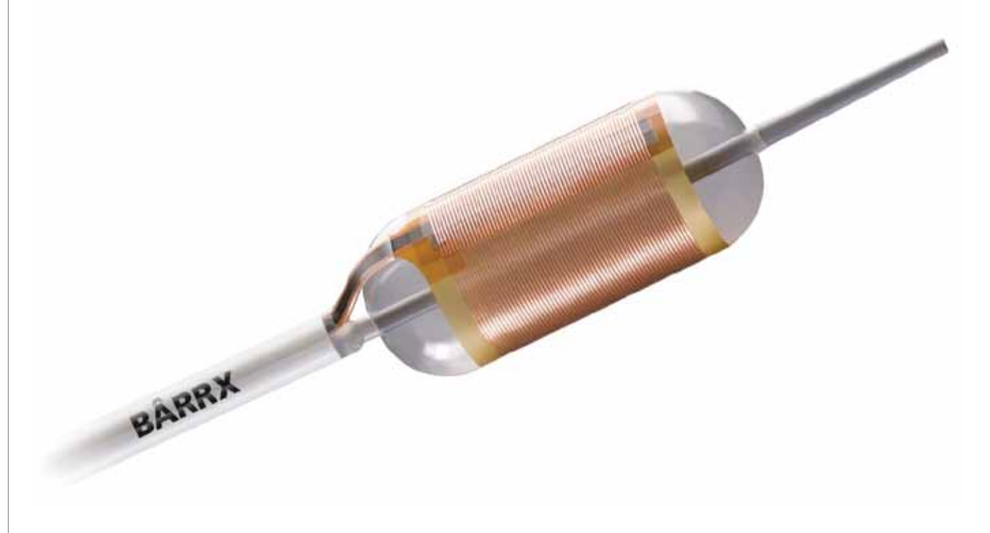
Fig. 2. Close up image of inflatable radiofrequency ablation catheter, which performs circumferential ablation of Barrett's esophagus.

to 1000 \mu m; this is deep enough to adequately treat Barrett's esophagus (500 \mu m) but superficial enough to minimize complications such as esophageal strictures.<sup>21</sup>