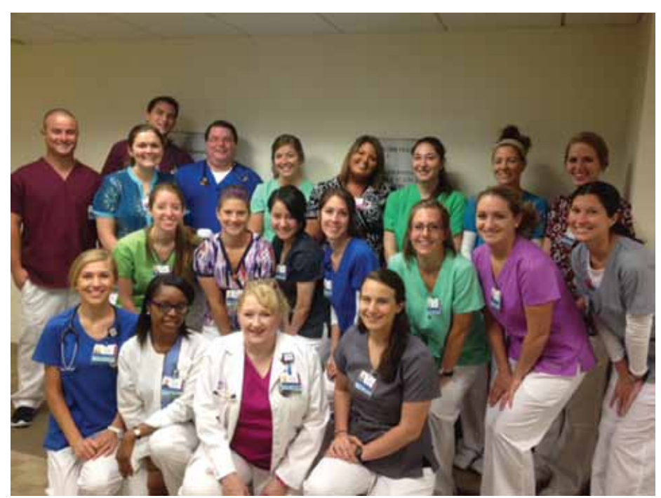
Fig. 1. 2014 cohort of Nurse Externs at LGH.

"I used to believe that every nurse eventually went on to become a 'great' nurse. But I now realize, the nurse who goes the extra mile, sees the patient holistically, and also treats the family compassionately is the great nurse." Another stated, "My personal belief about nursing changed positively, I believe that as a nurse I truly impact patients, and families, as well as impact their future. An extern faculty member taught me 'never underestimate the gift of giving yourself.' I learned a positive attitude and compassion—even in the smallest amount—can impact a patient's outcome. I now believe I